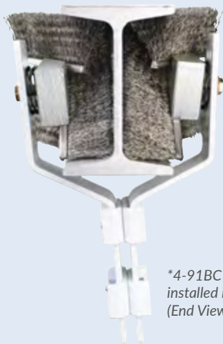
*4-91BC shown installed in rail. (End View)