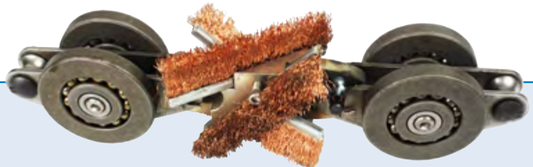
* RW91 Shown Installed in Chain

* Phosphorus Bronze brushes are standard for RW91 assemblies and replacement brushes. Stainless Steel brush assemblies (PART # RW91SSA) and replacement brushes (PART # B91316RB) are also available.