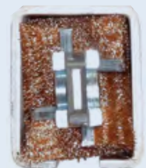
* Shown Installed in Track