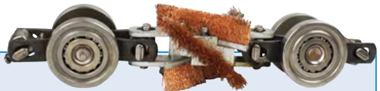
* Shown Installed in Chain

* Phosphorus Bronze brushes are standard for UN91 assemblies and replacement brushes. Stainless Steel brush assemblies (PART # UN91SSA) and replacement brushes (PART # B913BRTB) are also available.