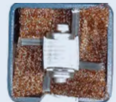
* Shown Installed in Track

NOTE: you do not have to remove link and link screws to replace brushes