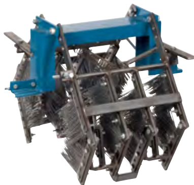
MODEL #300-I For Three Inch I-Beam