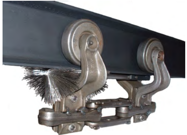
*30Y shown installed on rail.