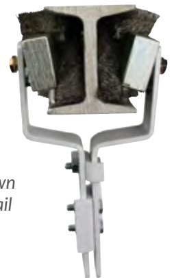
*3-91BC Shown Installed on Rail

See our website for information on Powered Cleaners as well as other Mighty Lube Equipment.