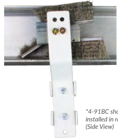
*4-91BC shown installed in rail. (Side View)