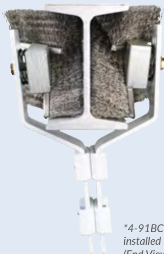
*4-91BC shown installed in rail. (End View)