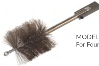
MODEL #40Y For Four Inch I-Beam

See our website for information on Powered Cleaners as well as other Mighty Lube Equipment.