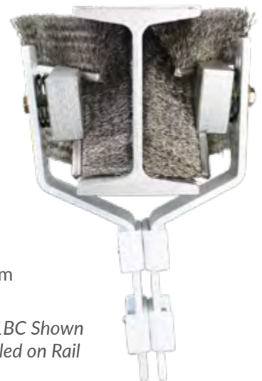
MODEL #4-91BC For Four Inch I-Beam